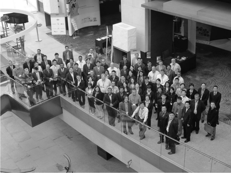
Group picture of some of the 3rd ICPC participants in the Hyatt on the Bund Hotel.